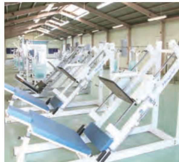
Initial load training and Weight training facility