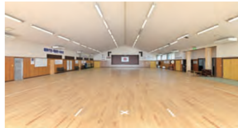
The largest martial arts hall dedicated to kendo