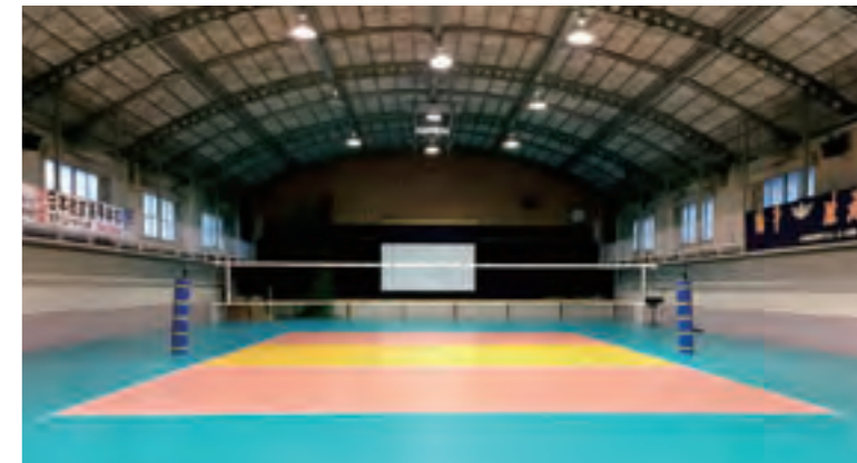
Taraflex volleyball court