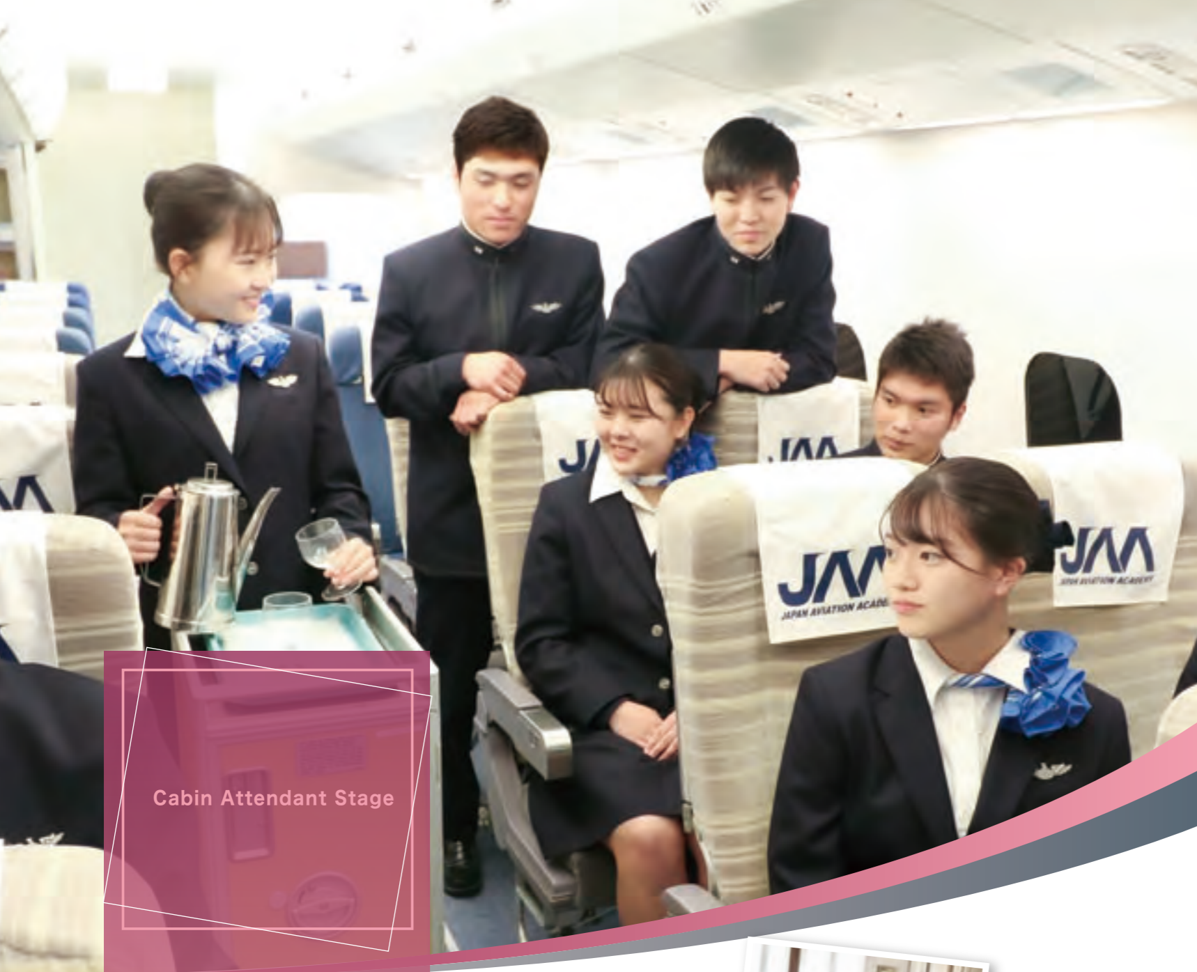
Cabin Attendant Stage

Don't let your dream just as a dream. Sky will be your future workplace.