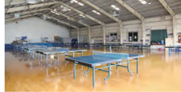
Table tennis GYM