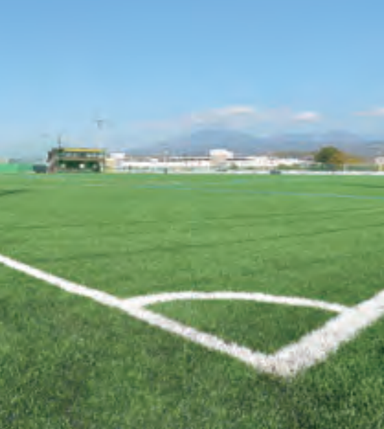
Fully artificial turf soccer field