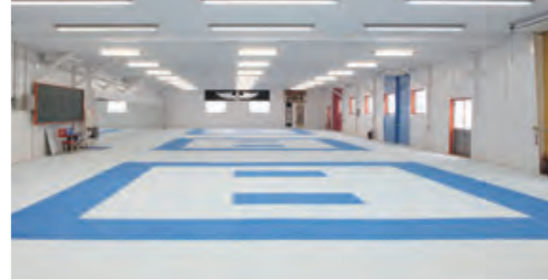
Karate training gym