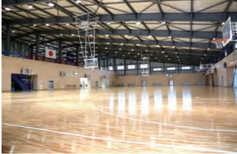
Basketball court and Volleyball court, largest gymnasium (J-Ship GYM)